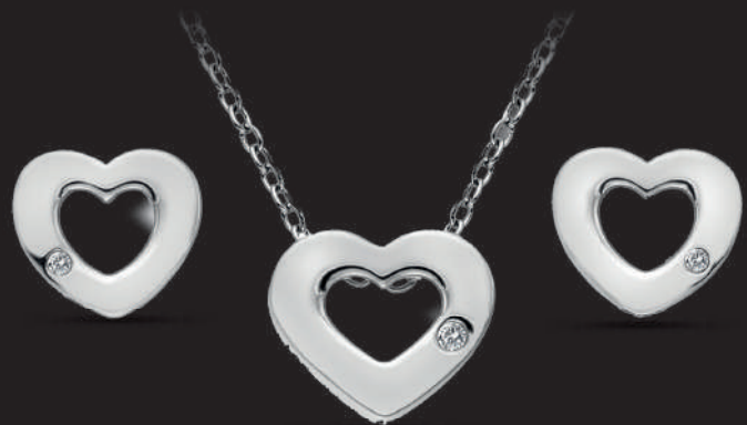
56. The Amulet Heart Set

Introducing the Amulet Heart Gift Set by Hot Diamonds. Crafted in Sterling Silver and set with genuine diamonds.