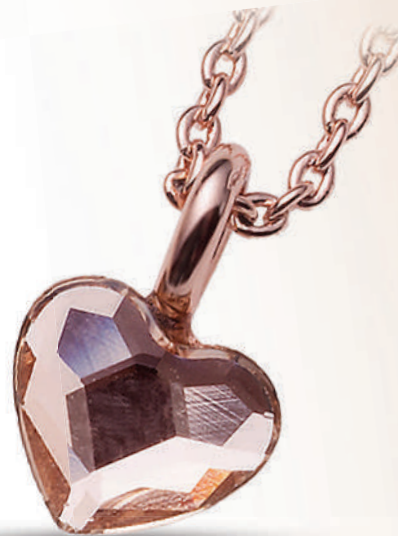
58. Rose Gold Heart Shape pendant and necklace

Equally graceful and flirty, this delicate pendant plated with 14 karat rose gold and adorned with a shimmering heart crystal could easily be your own favourite daily piece or a delightful souvenir choice for a loved one.