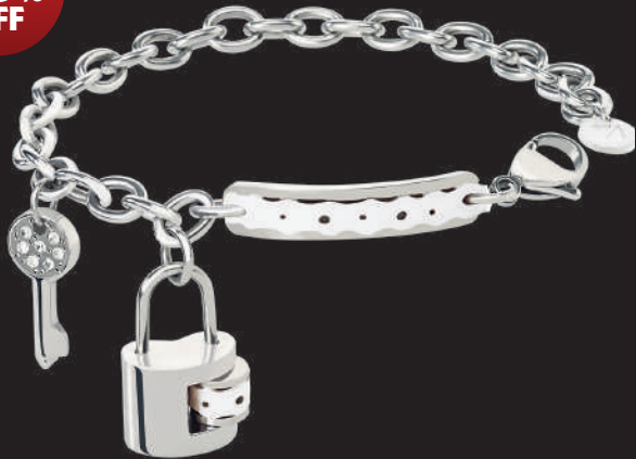
53. Bracelet Cadenas Pure

Zeades Monte-Carlo, A Monaco-Based Design House, creator of leather jewellery since 2004. Bracelet Cadenas Pure, all stainless steel and genuine italian leather. Austrian Crystals. Adjustable.