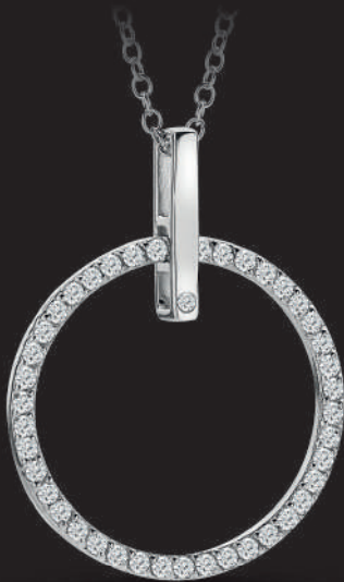
55. Constant Circle Pendant

The Constant Pendant by Hot Diamonds is crafted in Sterling Silver, set with a genuine diamond and white topaz gemstones.