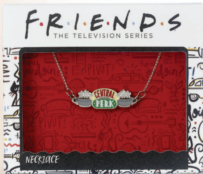
59. TV Show Central Perk Necklace

The meeting place for the main characters in the FRIENDS sitcom, Central Perk is an iconic landmark for any friend's fan. The Logo is instantly recognisable and now you can be part of this iconic show and wear your own central perk logo necklace. Made from silver plated zinc alloy and coloured enamel 16-inch trace chain with a 2 inch extender Silver plated chain and coloured enamel logo Supplied on Branded FRIENDS Packaging. The Carat Shop are the licensed manufacturers of FRIENDS Jewellery & Accessories on behalf of Warner Bros.