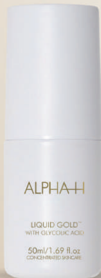
37. Liquid Gold 50ml

This award-winning overnight resurfacing tonic with 5% Glycolic Acid uses a state-of-the-art low pH delivery system to radically improve the texture and appearance of the complexion. Clinically proven to reduce wrinkle depth, boost moisture levels and reduce roughness.