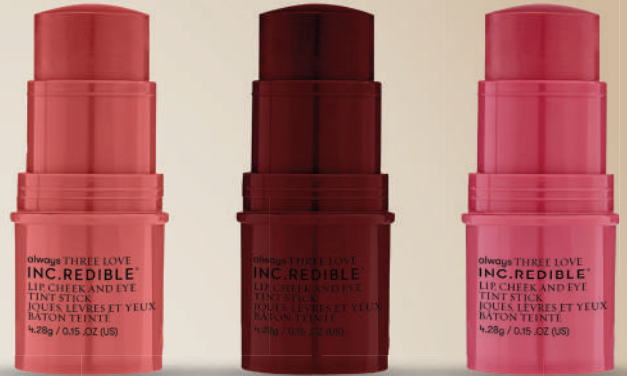
36. Three Love Lip, Cheek & Eye Tint Stick (Set Of 3)

It's a triple-delivery formula that works as a sheer Blush, hydrating lip tint and Eyeshade. Build and blend as you go, adding to the beautiful natural colour payoff. Hydration is key - Enriched with shea butter, A highly moisturising ingredient to help soothe and smooth red and dry or fatigued skin for that effortless pop of colour. Swipe across your lips, cheeks or eyes to create a monochromatic look.