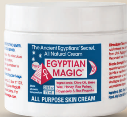
38. All Purpose Skin Cream 75ml

This all-purpose, all-natural balm is made from six of nature's most powerful and healing ingredients. Use as a facial moisturiser and eye cream, hair conditioner, lip balm, nail and cuticle conditioner, and to treat conditions like eczema, psoriasis and atopic dermatitis. It's formula also makes it perfect for helping to prevent stretch marks, fading scars and healing blemishes.