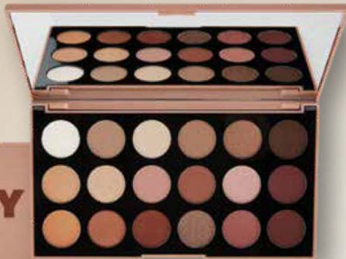
36. Runway Ready Artistry Palette

Fashion takes flight in an essential 18-pan curation for any-destination artistry. Perfectly packed with ultra-versatile, universally flattering neutrals—in Morphe’s signature matte, metallic, and shimmer finishes- this on-trend palette guarantees a stylish arrival, day or night, near or far.