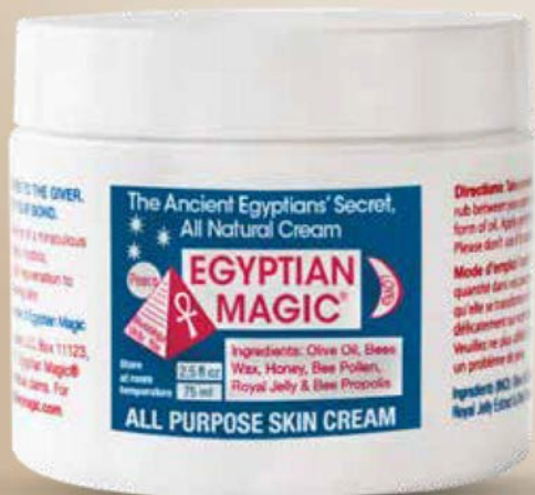
38. All Purpose Skin Cream 75ml

This all-purpose, all-natural balm is made from six of nature’s most powerful and healing ingredients. Use as a facial moisturiser and eye cream, hair conditioner, lip balm, nail and cuticle conditioner, and to treat conditions like eczema, psoriasis and atopic dermatitis. It’s formula also makes it perfect for helping to prevent stretch marks, fading scars and healing blemishes.