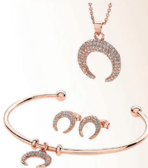
65. Crystal Crescent Moon set

Reflecting the beauty of the night sky, this enchanting set of pendant, earrings and bracelet, with crystal crescent moon pendants, will add something special to your day. The pretty moon shapes are encrusted with glittering crystal, creating a contemporary and opulent feel, catching the light from every angle. Finished in a romantic rose gold, this is a set you will love to wear day and night. Presented in a gift box.