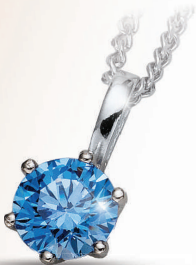
64. Blue Stone Silver Necklace

Pure as the bright summer skies and sparkling like a diamond, the Brilliance pendant relies on its vintage minimalistic design.