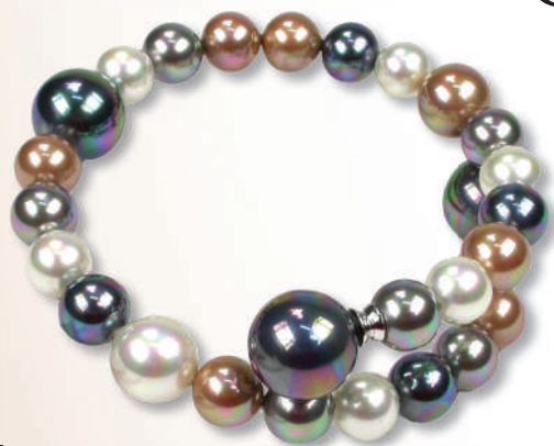
66. Adara Pearl Bracelet

A lovely rigid bracelet in an exquisite combination of sizes and colors of first quality organic Majorcan pearls together with 925 sterling silver elements. The white, copper, grey and black pearls are in 10 and 12 mm and the length is adjustable to fit all sizes. Handcrafted in Orquidea's own factory on the beautiful Spanish Island of Majorca.