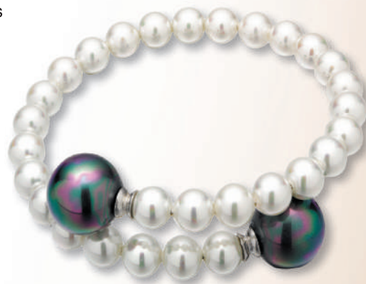
67. Duo Bracelet

A stunning rigid bracelet in 6mm white and 12mm black first quality organic Majorcan Pearls with sterling silver elements. A genuine, handcrafted bracelet from Orquidea's traditional pearl factory on the Spanish island of Majorca. A classic looking bracelet that can complement both a formal and casual look. The bracelet wraps around the wrist for a one size fits all. The pearls are guaranteed for 10 years.