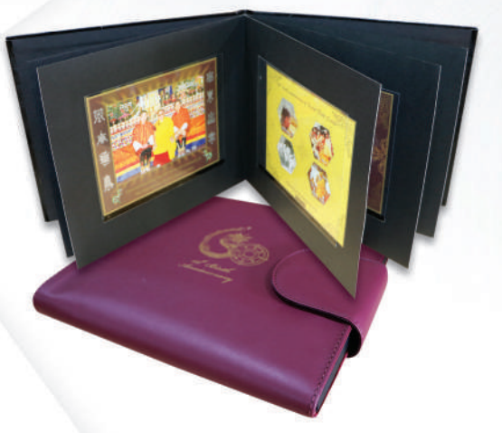
104. 60<sup>™</sup> ANNIVERSARY LEATHER CASE STAMP ALBUM US$ 41