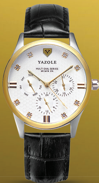
56. Mens Watch Gold Chronograph

A distinguished watch for everyday wear. Features a quartz 6 pointer movement with time in both 12 and 24 hour format, day and date, encased in a gold bezel and stainless steel back with vegan-leather black stitched straps. 3 ATM water resistance.