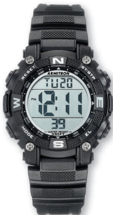
58. Gents Digital Watch

38mm Round Black digital strap. Features 12 and 24-hour time, seconds, day/date, chronograph with lap time, alarm, dual time, and EL function. Black polyurethane strap with textured center sections, black polyurethane loop and brushed stainless steel back and buckle.