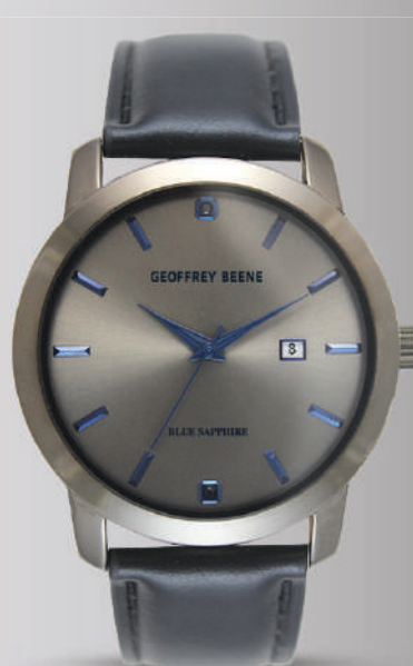
53. Manhattan Blue Sapphire Collection Gents Watch

The Manhattan collection is a classic yet contemporary timepiece inspired by the uniqueness of New York City. This style features a contemporary decorative chronograph, gunmetal sunray dial, blue sapphire accents.