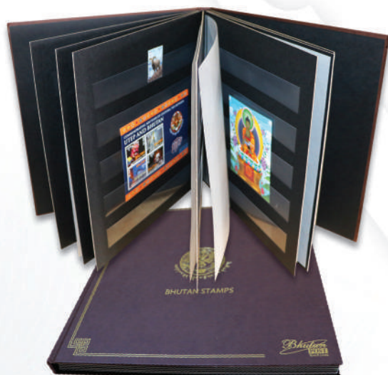
105. 12 PAGE STAMP ALBUM US$ 27