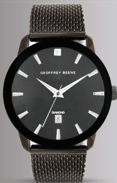
52. Manhattan Collection Gents Watch - Gunmetal

This classic yet contemporary timepiece inspired by the uniqueness of New York City features a contemporary stealth like gunmetal dial. An alloy metal case, stainless steel case back and adjustable mesh band ensures durability.