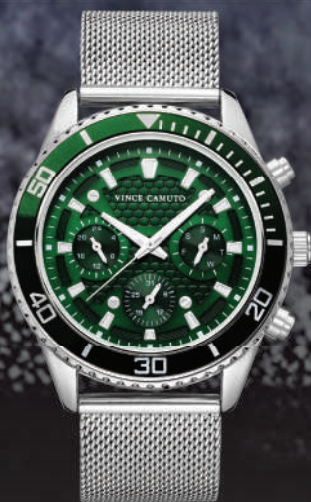
44. 44mm Silvertone Steel Mesh Green 3 Eye Dial

44mm analog round silver-tone stainless steel mesh band watch. Features silver-tone coin edge bezel with green top and a silver-tone numeral seconds track. Multi-zone green dial with silver-tone hands and markers. Dial features day of the week, date, and 24-hour sub dials. Polished silver-tone stainless steel mesh band with stainless steel sliding adjustable buckle closure. Splash resistant.