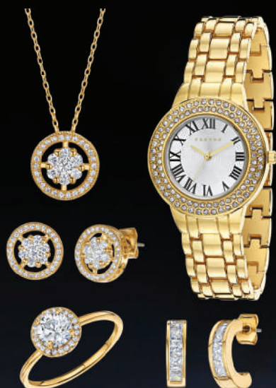
42. Elegante Watch and Jewelry Set

This captivating watch and jewelry set from Fervor Montréal includes a gold plated watch (Japanese movement and splash resistant) bedecked with crystal accents along with 2 pairs of earrings, a matching necklace and a size adjustable ring to compliment the look. All presented in an elegant black gift box.