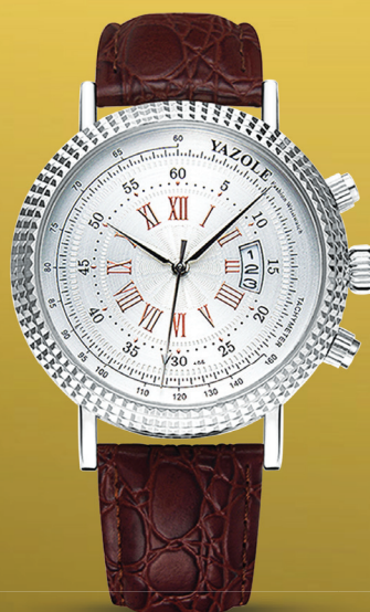
57. Watch Silver/Rose Gold With Brown Strap

Make a statement with this striking timepiece. Features a quartz 3-pointer movement that is set in a rose gold case and stainless steel back with vegan-leather black stitched straps. 3 ATM water resistance.