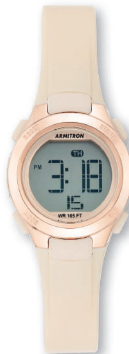
59. Ladies Digital Watch

27mm Round Blush digital strap. Features polished rose gold-tone stainless steel top ring. Hours, minute seconds, day chronograph, alarm and EL function. Blush matte polyurethane strap and loop with stainless steel case and buckle.