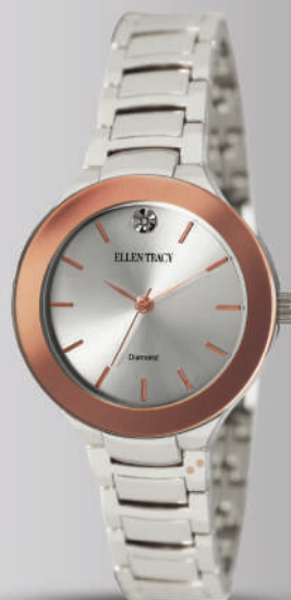
51. Motif Collection Ladies Watch Silver Tone Rose

The Motif Collection, perfect for the everyday wearer. This silver tone watch features a rose tone metalized glass bezel. A Genuine Diamond mounted in a miracle setting shines at 12 o'clock.