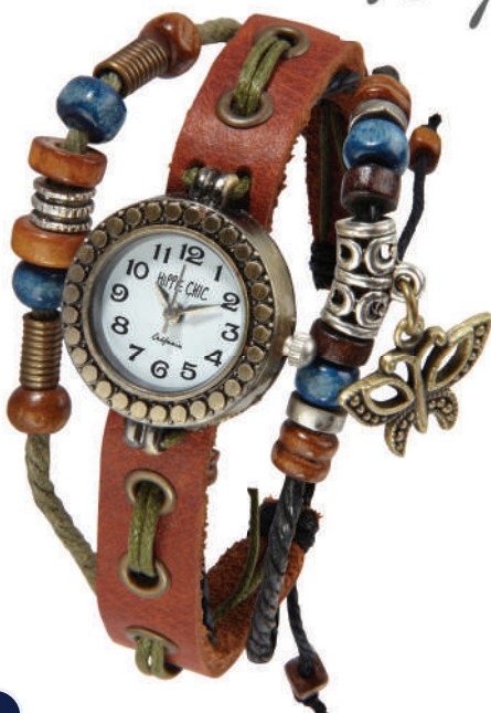
60. Boho Watch and Bracelet Set

Vintage face and braided cord, Hippie Chic will add a retro twist and laid back style to your outfit. This Travel Exclusive duo pack provides a Hippie Chic bracelet to complement the stacking trend.