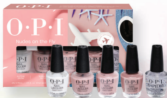
41. Nudes On The Fly (3.75ml x 5)