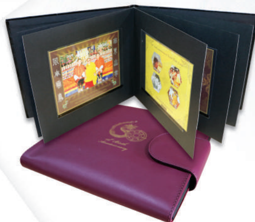
104. 60 TH ANNIVERSARY LEATHER CASE STAMP ALBUM US$ 41