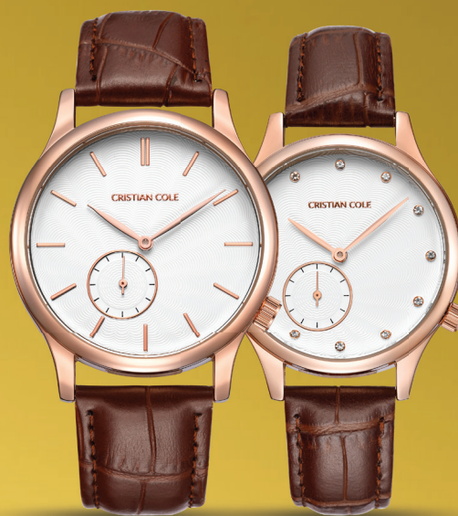
55. His & Her Watch Set

Complete your look as a couple with Cristian Cole's stunning His and Her watch set. Modern looking watch casing in rose gold with brown leather strap. A little sparkle to her and simplicity for him, we have watches to show off your style together!