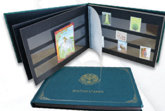
106. 10 PAGE STAMP ALBUM US$ 16

Bhutan Post has historic stamps ranging from 1960s till date. These stamps depict not only our cultural and traditional values, but also the beauty of our geographical and environmental nature. The varieties of stamps include various themes such as Royals, Flora and Fauna, Scenic views, Commemorating Diplomatic Relations, Culture and Heritage, and so forth.