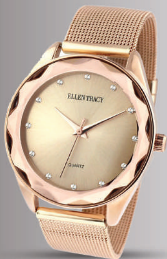
50. Ellegrance Collection Rose Gold Ladies Watch

The Ellegrance Collections features a Rose Gold Tone stainless steel adjustable mesh strap, faceted mirrored glass & a 12 stone index sunray dial.