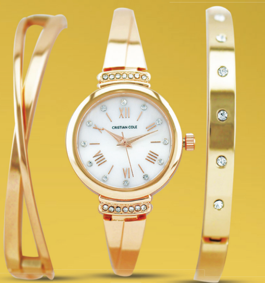
54. Glittering Watch & Bangles Set

Finding matching accessories can be something of a nightmare for the modern woman, but Cristian Cole has solved that problem with this glittering watch and two bangles gift set. The watch itself is a standalone head-turner, with its pearly white face offset by a jewel encrusted case and with two stunning Jewellery-clasp closure bangles. This sparkly duo will complement any evening gown or cocktail dress, enabling her to shine on that next big occasion.