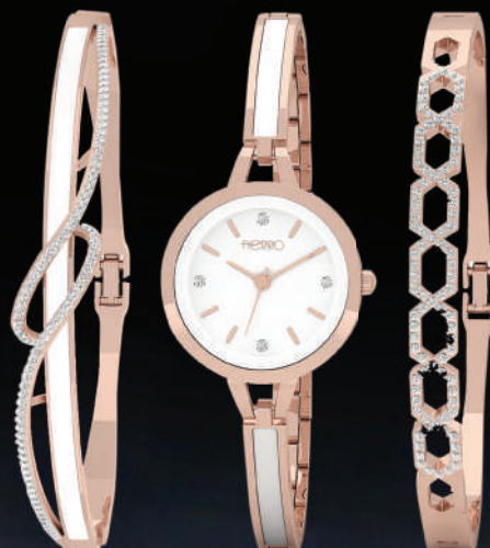
43. Allure Watch and Double Bangle Set

Show off your sophisticated style when you wear this expensive looking rose gold plated watch, 3ATM water resistant, with high precision Japanese movement quartz, and matched with eye-catching two bangles adorned with radiant crystals. Wear this set with any ensemble from business casual to everyday wear for a polished look.