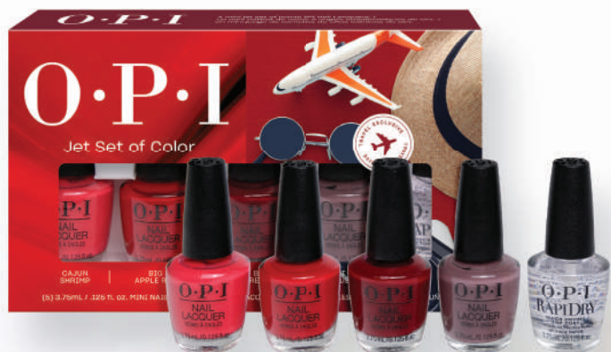
40. Jet Set Of Color Set (3.75ml x 5)