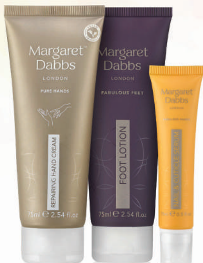
38. Travel Fabulous Feet & Hands Duo (75ml x 2, 15ml x 1) - Travel Retail Exclusive

Achieve beautiful Hands and Feet on the go with this gorgeous Margaret Dabbs™ London set, which will instantly transform the way they look and feel.