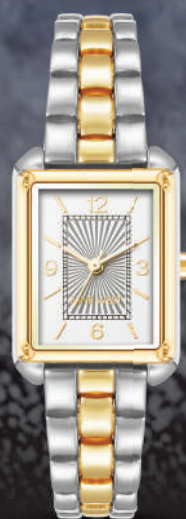
45. Grey Metal Strap Ladies Watch

23.5 x 33mm analog rectangular two-tone adjustable link bracelet watch. Features polished silver-tone case and gold-tone bezel. Silver-tone dial with black pattern inner track, gold-tone hands and markers. Polished outer silver-tone with polished inner gold-tone link bracelet band with jewelry clasp closure. Splash resistant.