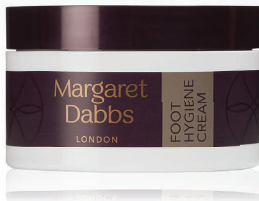
39. Foot Hygiene Cream 100g

The award-winning Foot Hygiene Cream is an expertly formulated treatment balm which will transform your feet from the first use.