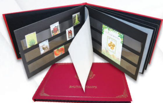
103. 6 PAGE STAMP ALBUM US$ 12